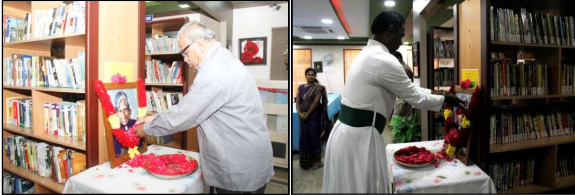
Tribute to the People's President Dr. A.P.J Abdul Kalam on his second Death Anniversary on 27 th July, 2017