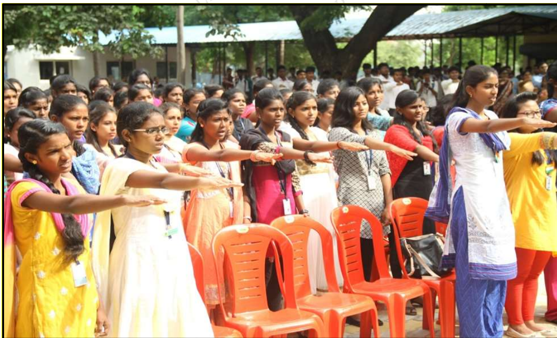
Students taking pledge on the Independence Day