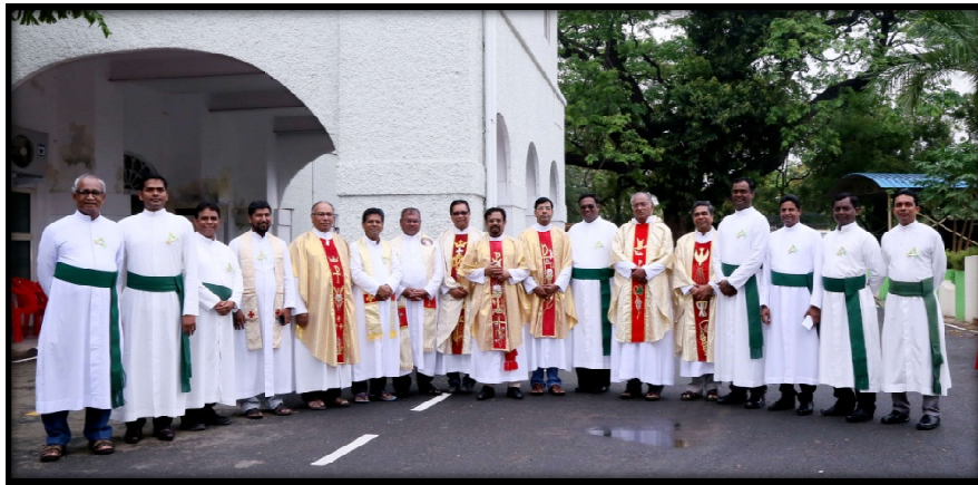
Reverend Brothers in campus during St Patrick's feast day