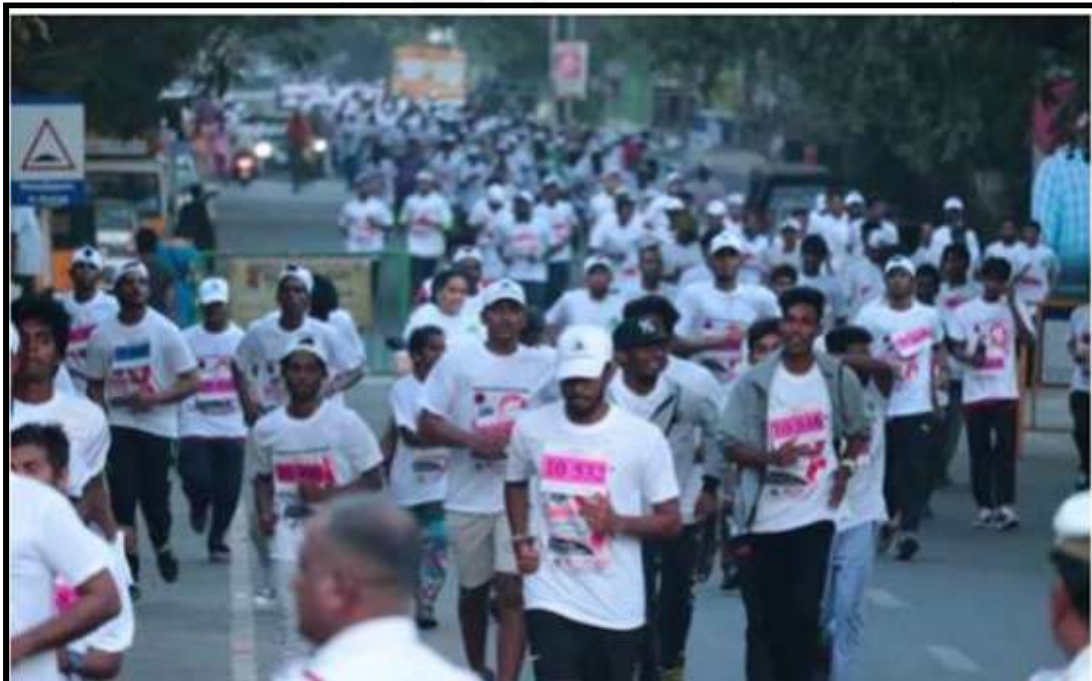
Cancerathon – Cancer Awareness Marathon