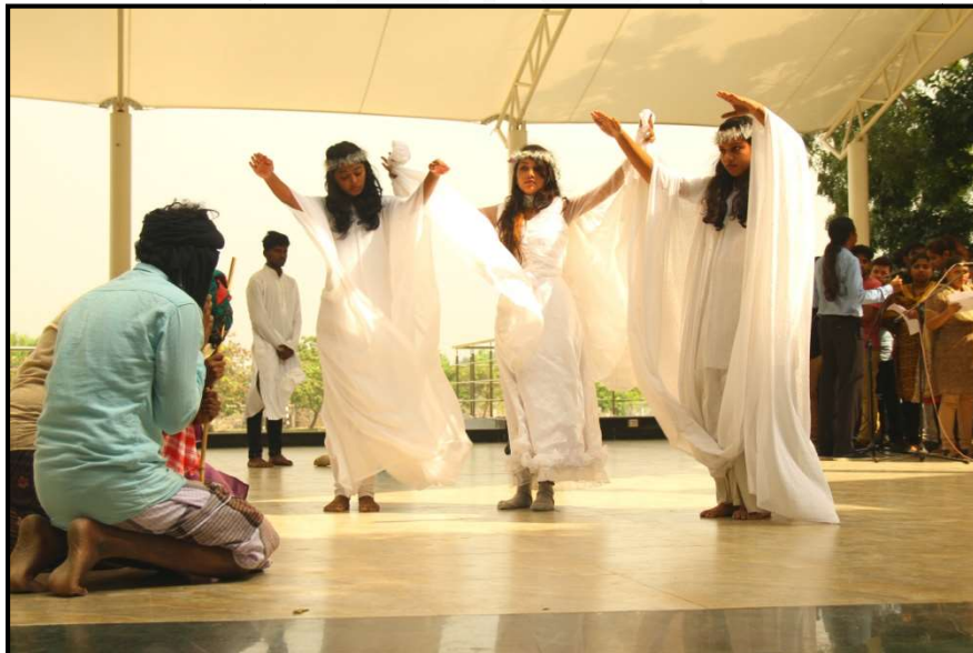
Nativity play by the students