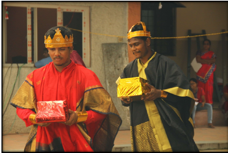
Nativity play by the students