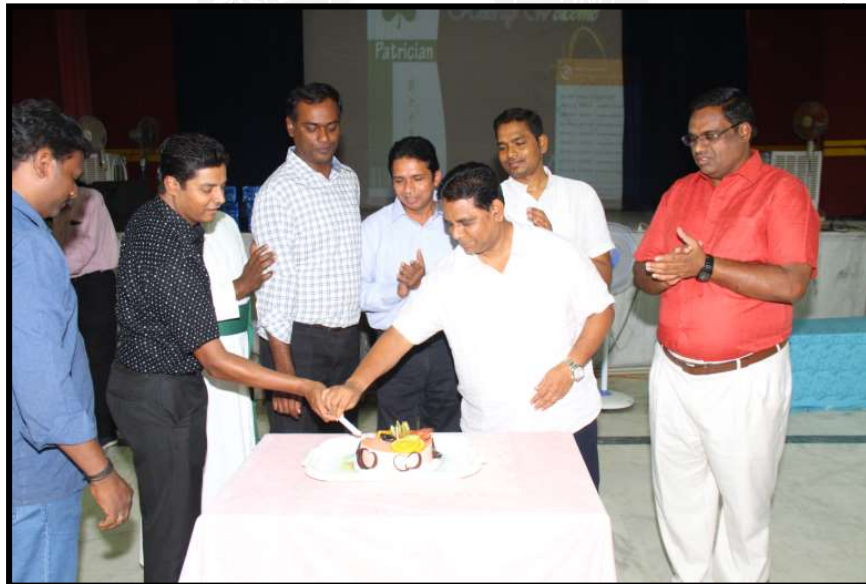
Reverend Brother cutting the cake on St Patrick's feast day