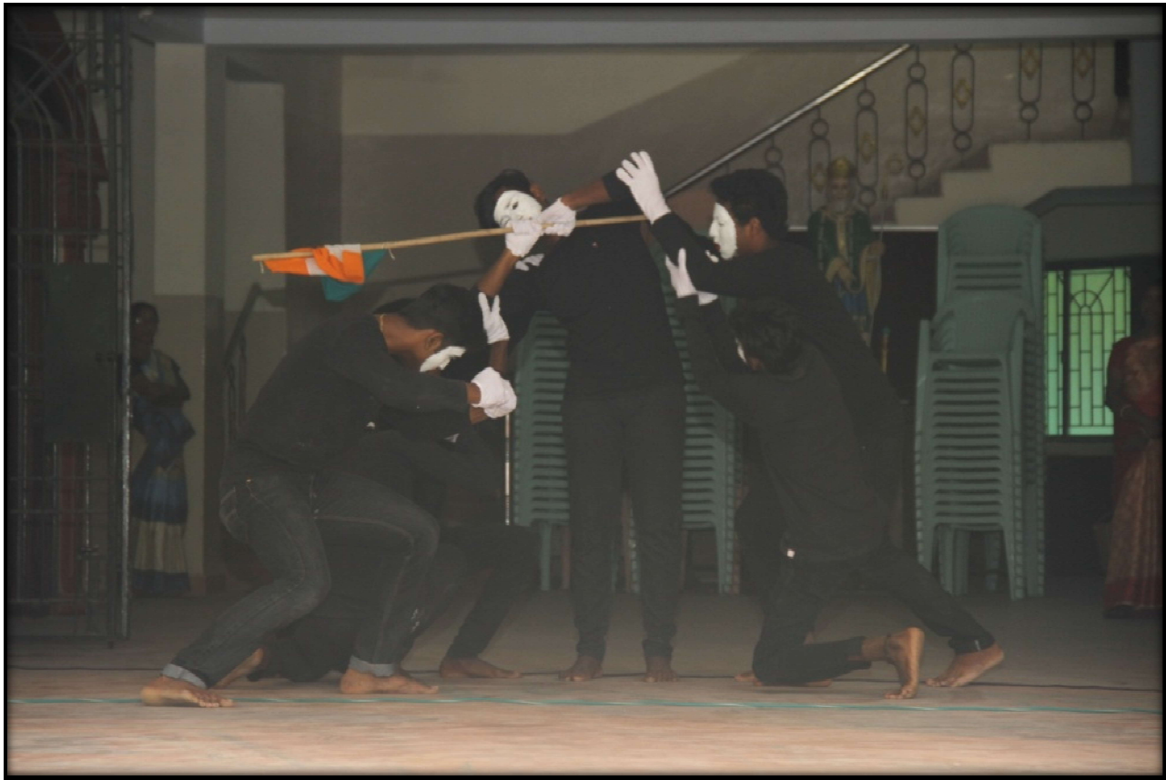
Mime on National Integration