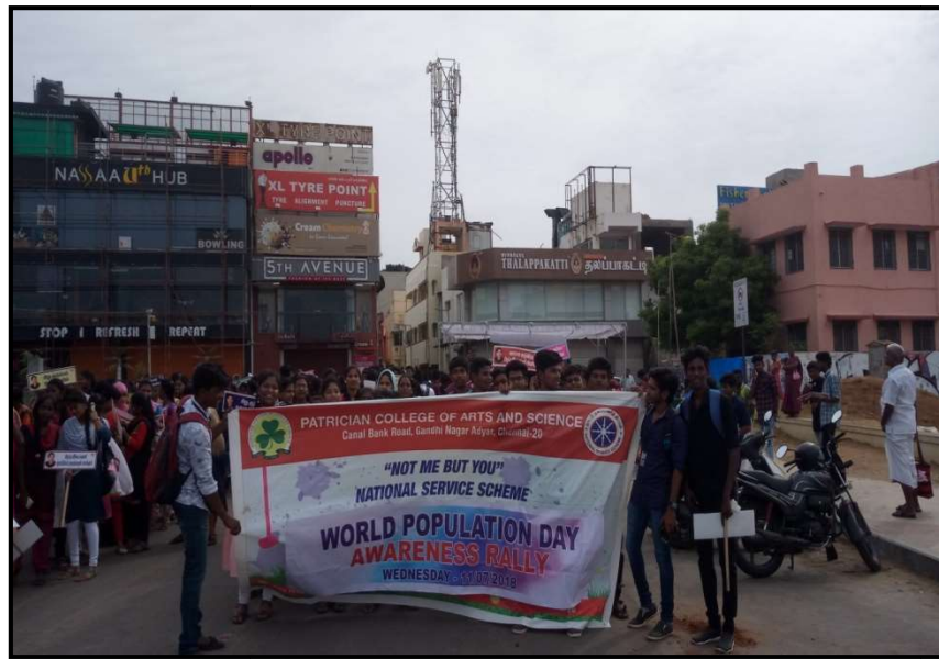
Active Participation of NSS Volunteers in the Rally

On 11 th July 2018 the NSS team organized a rally to create awareness on population explosion and dire consequences.