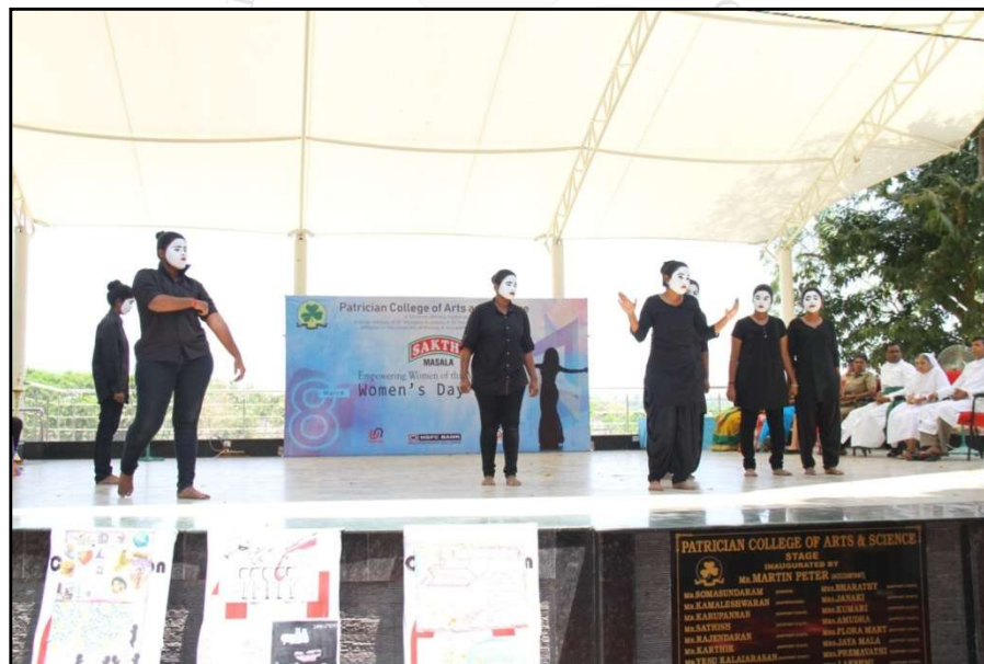
Mime performance by students during Women's Day celebrations.