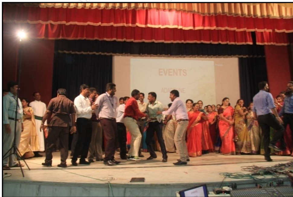
Faculty in a lighter mood during the teachers' day celebrations