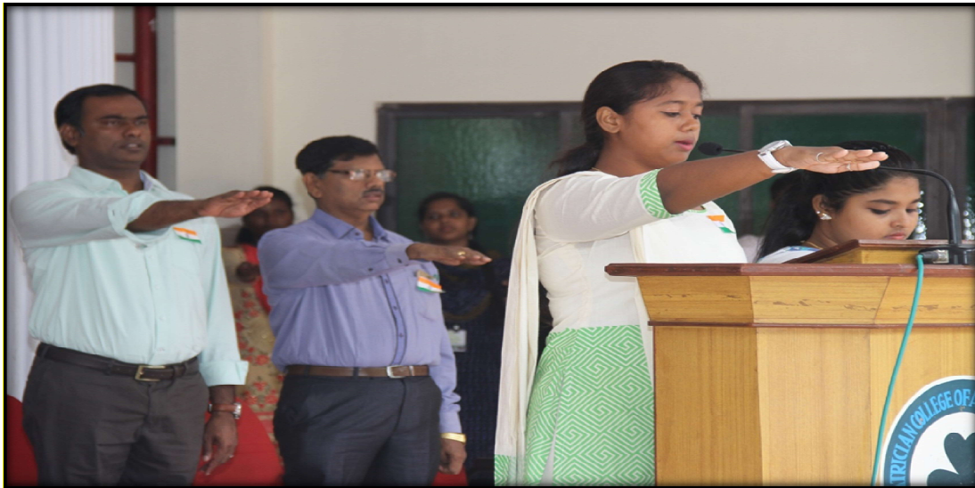
Director, Principal and the student council taking pledge on the Independence Day